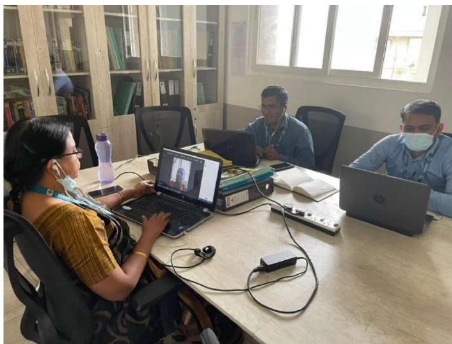
“Organizing team during the sessions”