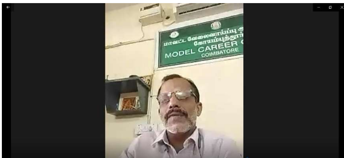
“Presentation by Resource Person”